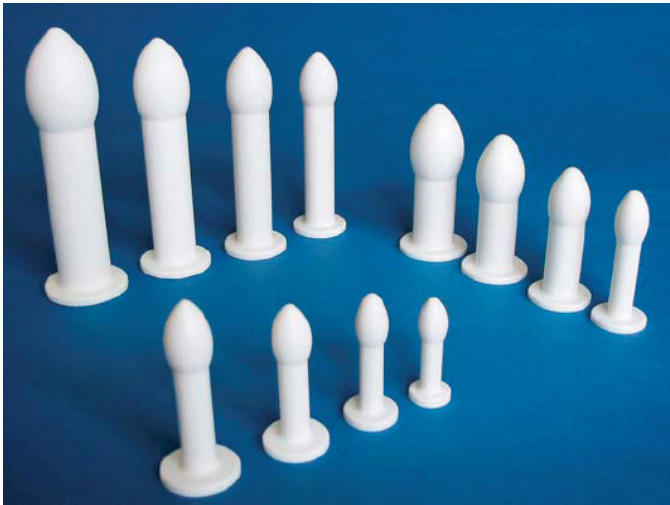
Vaginal Dilator Sets, Product ID: DT-A, DT-B, DT-C

Visit our website: www.bioteque.com or call 1-800-889-9008 fax 1-408-526-9399